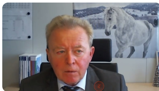
EU Commissioner for Agriculture, Janusz Wojciechowski

After the release of the positive evaluation of the EU Promotion Policy this week, an agri-food stakeholder alliance exchanged with EU Commissioner Janusz Wojciechowski on the future set-up of the EU agri-food promotion. Not only did the annual promotion budget decrease for 2021 from €209 million to €183 million, but a 30% share is earmarked for the promotion of organic products.