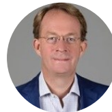
Jan Derck van Karnebeek